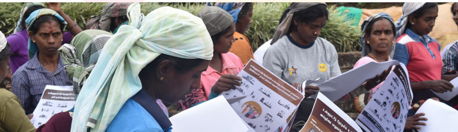
A voter reads an instruction sheet on how to vote correctly

With extensive knowledge and experience of the plantation sector in Sri Lanka, Chrysalis was the go-to-partner for the International Foundation for Electoral Systems (IFES) to implement a voter awareness programme in the plantation sector. The programme addressed the long-standing concerns regarding voter turn-out and rejected ballots. Over 1,000 plantation community members from four estates in the Nuwara Eliya District who are eligible to cast their votes in the local government election were reached through this programme. A total of 37 Voters Awareness raising programmes were conducted in 22 divisions of 4 tea estates. There were 1113 participants of whom 726 were female.