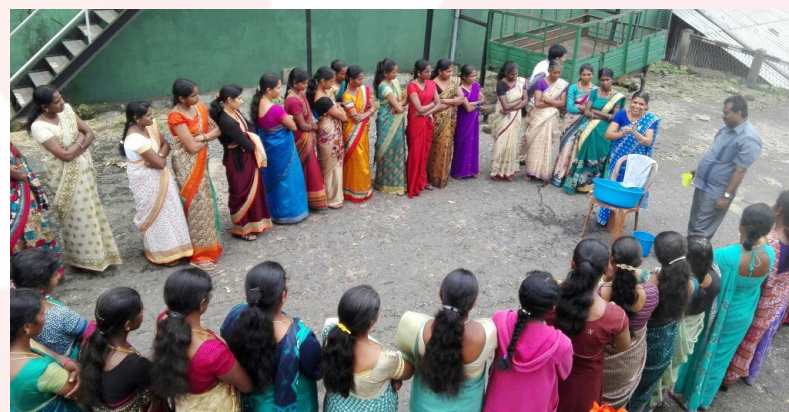
A module of the P.A.C.E. training being conducted by the welfare officer at one of the estates

Chrysalis continues to work closely with tea plantation companies and communities, supporting the sustainable development of the sector and enhancing the quality of life of people working and living on Sri Lanka's tea estates. Currently, we are implementing the Personal Advancement & Career Enhancement (P.A.C.E.) training curriculum, designed and funded by GAP Inc. to provide women with the foundational life skills they need to advance in their personal lives and in their careers. Chrysalis partnered with GAP's Master trainer to adapt the training module to the plantation context and has implemented it in 23 estates for 1200 women over the last year.