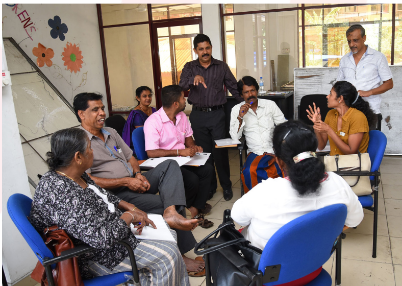
Praja Mandala training at Poojapitiya

Funded by European Union and CARE Deutschland-Luxemburg e.v., the RTM project is focused on bringing about a meaningful engagement of plantation communities in democracy and governance. The project aims to promote the rights and entitlements of citizens living and working in the tea plantations of the Central and Uva Provinces of Sri Lanka. Project activities include a functional Tamil language training for 300 government staff in the Uva and Central Provinces and providing Training of Trainers (ToT) for selected officials from Pradeshiya Sabhas and Divisional Secretariat Divisions on leadership team building, positive thinking, report/letter writing, communication, conflict resolution, participatory governance, PRA and Village Development Planning, proposal writing and fund raising. Simultaneously the project is also working with the two provincial councils to establish a women's policy to consolidate meaningful participation and equality for women.