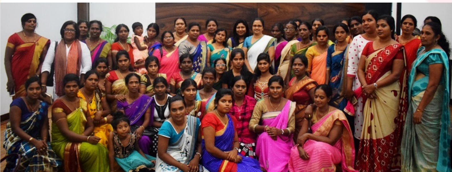
Aspiring female political leaders from the North meet current and past political leaders from the South

36 participants out of 420 women and men who were the main beneficiaries in NET project contested the recent Provincial Council elections, a significant achievement for the project which is less than two years old. Up to seven women stand to take office once the process has been regularized'. NET project supported by the European Union and CARE Deutschland- Luxemburg e.v. seeks to promote the voice and meaningful political representation of women in Northern Sri Lanka to prevent and address Sexual and Gender based Violence (SGBV). This programme was also linked to a nation-wide advocacy campaign led by the Ministry of Provincial Councils and Local Governance and the Ministry of Women's Affairs to fulfil the recent change in the Electoral Act that ensures a 25% quota for women in local governing bodies. A Study is also being done on women's political leadership and reduction of violence against women with the intention of undertaking targeted advocacy initiatives.