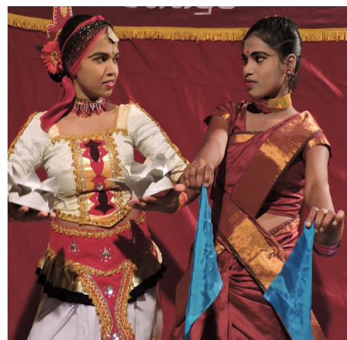
Students from North & South perform together during an exchange programme