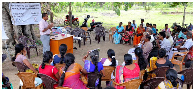
Village Development Plan training, Mullaitivu

Supported by The OAK Foundation funded "The Strengthening Policy and Action through Citizen's Engagement (SPACE)" project is aimed at empowering marginalized communities, especially the poorest women and youth in Sri Lanka, to actively engage in governance; to determine their development priorities; and define solutions. The action has influenced all levels of government to engage citizens in decision making platforms – Praja Mandala's (PM) - to respond to their rights and entitlements and demonstrate greater accountability towards effective service delivery. With the direct guidance of the Ministry of Provincial Councils and Local Governance (MPCLG) over 220 PMs were established and strengthened in the North, East, Uva and Central provinces of Sri Lanka providing opportunities for women and youth to lead almost 40% of these governance platforms. The PMs have been recognized and endorsed by the Government of Sri Lanka as a community governance model that will connect and engage communities in decision making. 75% of PMs have initiated almost 200 community development initiatives that were supported by local officials, local philanthropists and some private sector companies. These initiatives addressed long standing concerns of the targeted communities.