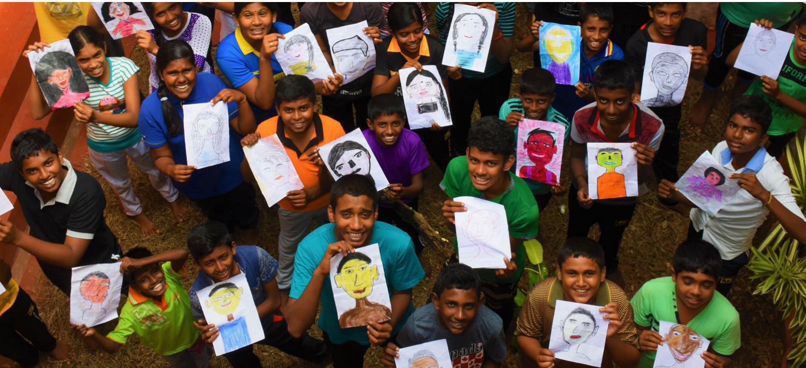
A participatory theatre production workshop promoting peace and reconciliation between children from different provinces