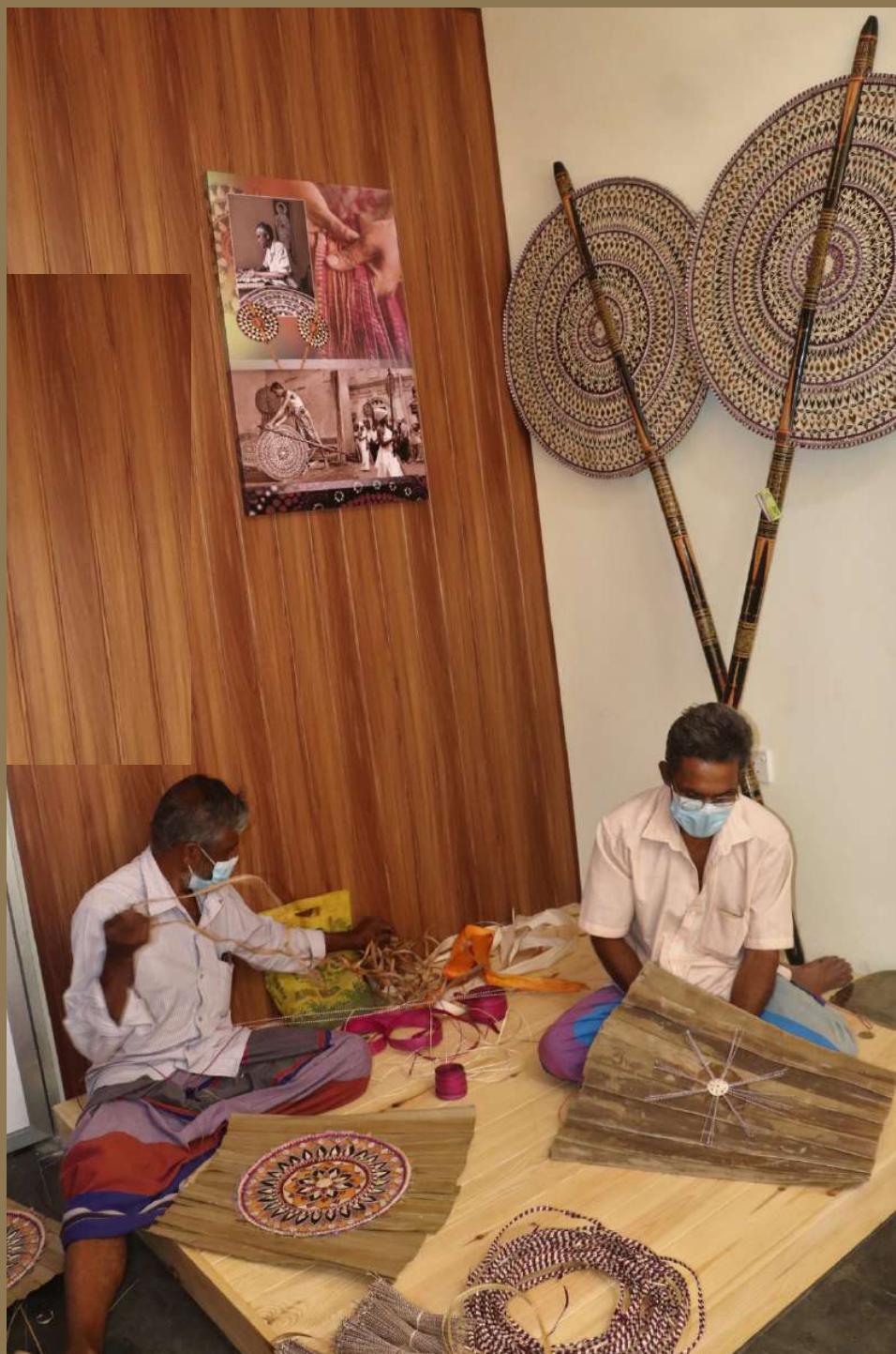
The Sesath Marketing and Demonstration Center