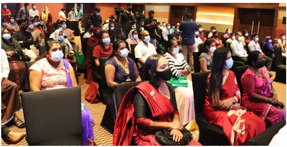
Stakeholders from diverse sectors, communities and local authorities participated

The project completion event took place at the end of November in Chilaw, in the presence all local stakeholders from local authorities to Praja Mandala members, to Youth Task Force members. The Governor of the North Western Province the late Hon. Raja Collure graced the event.