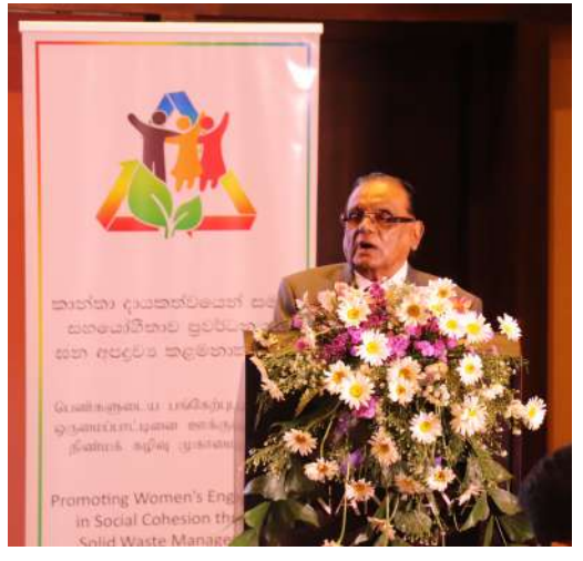
The Hon. Governor addresses the gathering