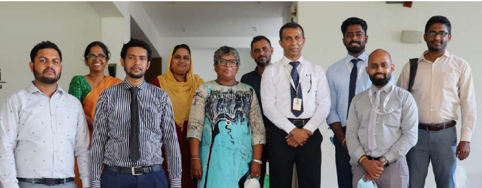
The jubilant SWM team take off their masks for a moment to celebrate!