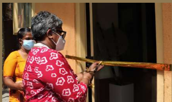
Opening of the Center