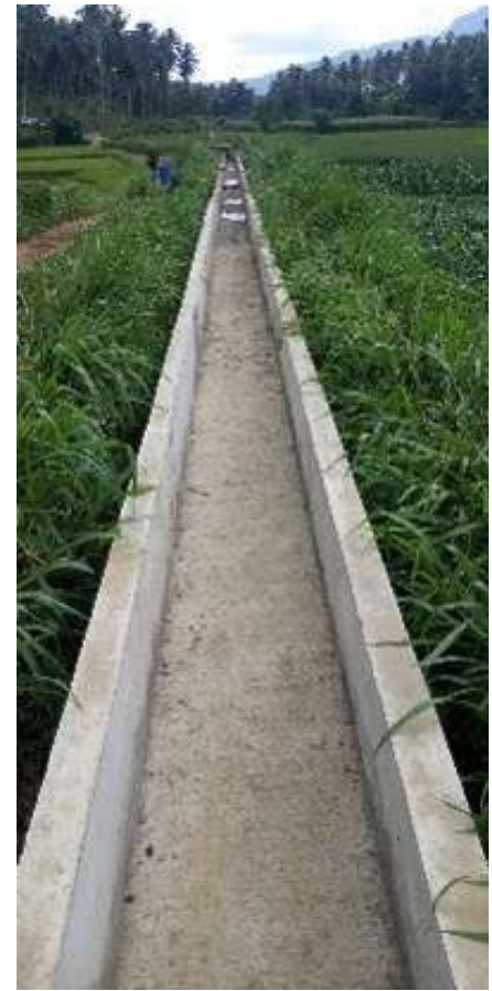
Udaxeragama Canal which will benefit around 750 people

Praja Mandala (PM) and Community Development Forums (CDF) were selected to facilitate the Economic Development Plans in consultation with PM/CDF members and respective Pradeshiya Sabhas. Community members took part in several participatory assessments to identify their economic and social development needs. While each PM and CDF identified 5 economic and social needs, based on the recommendations made by community members and participants, rural infrastructure was prioritized at the end of each session.