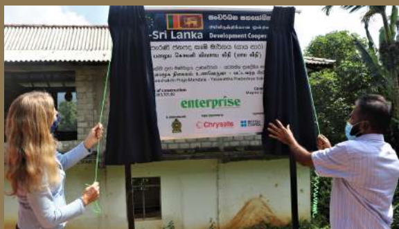
Opening of the renovated road

In addition to the infrastructure, the Direct Aid Program (DAP) funded by Australian High Commission, Sri Lanka and Maldives and managed through the Department of Foreign Affairs & Trade's (DFAT), supported Chrysalis to take a holistic approach and address the factors that hinder growth in this industry, including their inability to establish and sustain competitiveness, develop economically viable products and the lack of collectivization among villagers who make the craft, especially coordination and collaboration between different generations. The interior of the Marketing and Demonstration Center was also funded by the Direct Aid Program.